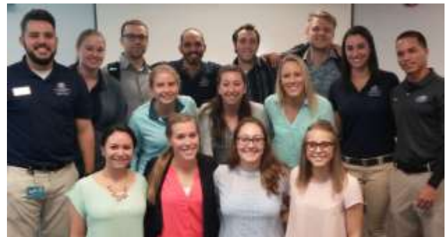
URI students pictured with Nova Southeastern University DPT students