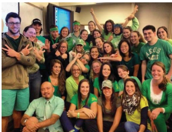
Above: Class of 2016 posed as “gangrene” last Halloween.