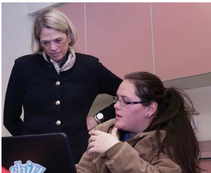
Pictured Top: Lady Chafee spends time with first year students in class.