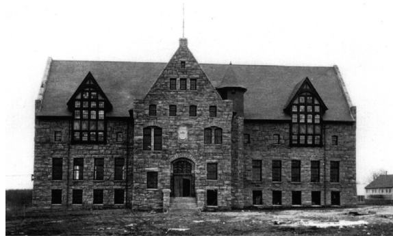
Lippitt Hall on the University of Rhode Island Kingston Campus as it may have appeared at the time of the founding of URI's Phi Kappa Phi Chapter