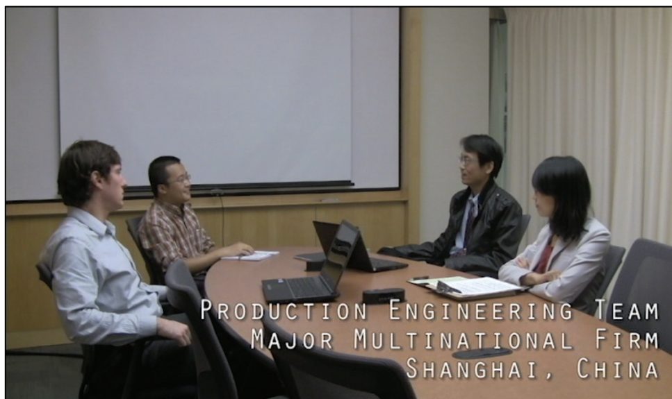
Figure 3. Screen Capture from Global Engineering Competency Vignette #1 66

This same scenario prompt was also used by the lead author to write a longer script that more completely illustrates how this type of work situation might play out in a real-world setting. The script was acted out by a group of graduate students, and the resulting video clips were edited to create Global Engineering Competency Vignette #1, as shown in Figure 3. This brief video (less than three minutes) is intended for use in courses and workshops where instructors wish to seed and facilitate case-based conversations about typical