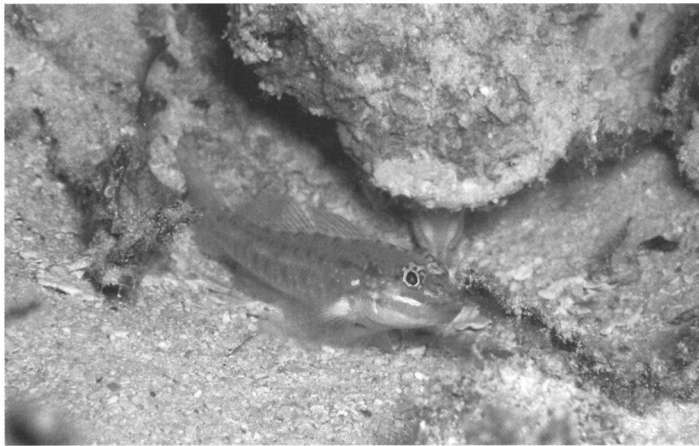
PLATE 1. A bridled goby ( Coryphopterus glaucofraenum ) waits near the entrance to a crevice. When gobies are threatened or attacked by large predatory fishes they flee to small crevices at the reef/sand interface like this one.

threatened or attacked by predators, mainly larger piscivorous fishes, gobies retreat temporarily to a refuge. A home range usually contains more than one refuge, and, since home ranges overlap, more than one goby may use any given refuge. Bridled gobies commonly occupy two habitat types: small patch reefs, where they reside at the sand/reef interface, and larger continuous habitat where coral/rubble is interspersed with enough sandy area for feeding. The cause of density-dependent mortality in gobies was unknown, but since predation is a major source of goby mortality (Forrester and Steele 2000, Steele and Forrester 2002) and gobies use structural refuges to escape predators, we hypothesized that a shortage of refuges might cause density dependence.