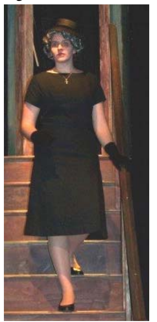
Halie

I also wanted Shelly to clash with Vince - Dodge makes a comment about how they go together like "chalk and cheese" and I wanted to accentuate this and keep this feeling that