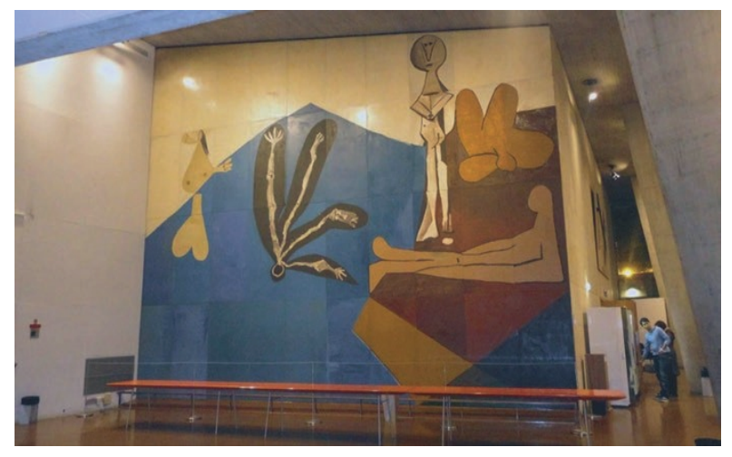
Image 8: Picasso, The Fall of Icarus, 1958. Acrylic on forty wooden panels. 910 × 1060 cm

Picasso's tableau depicts distorted figures in different poses near a sea, surrounding a charred figure falling from the sky. In its initial reference to the triumph of life and spirit over evil, The Fall of Icarus signifies a struggle between the forces of good and evil. Mankind is both languid spectator and dramatic victim in this scene: Picasso himself suggested the tableau merely depicts "des gens qui se baignent, tout simplement"; a simple scene of bathers. What once was intended as a dark spirit, a fallen angel, became an overconfident human who flew too close to the sun. But his dramatic fall into the sea is witnessed with awkward indifference. Our generation is confronted with climate change, loss of biodiversity and large-scale pollution of our ecosystems. The scars will be of such a scale that they will remain permanently visible in the earth layers currently formed as well as in dramatic shifts in animal and plant life. These shifts signify the birth of a new geological era: the Anthropocene. Sustainable development is often suggested as a key strategy to counteract the negative impacts. But as Picasso's bathers, we hardly bother to look up from our daily affairs to this disaster in slow motion." (Landeweerd 2018).