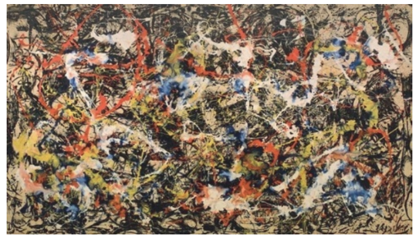
Image 3: Jackson Pollock, Convergence (1952). Oil on canvas: 237 cm × 390 cm

In a philosophical postscriptum to his famous essay What Is Life (1944), Erwin Schrödinger states that quantum indeterminism should not be regarded as in some way providing a physical basis for free will, stating: "I wish to emphasize that in my opinion, and contrary to the opinion upheld in some quarters, quantum indeterminacy plays no biologically relevant role in them, except perhaps by enhancing their purely accidental character in such events as meiosis, natural and X-ray induced mutation and so on -and this is in any case obvious and well recognized". But following de Broglie David Bohm would develop a different point of view. He picked up on the intuitions of de Broglie, comparing quantum processes with human consciousness. Louis de Broglie originally conceived of such an analogy, but eventually abandoned it. Bohm however took up this old position, stating: "[The atom] can best be regarded as a poorly defined cloud, dependent for its particular form on the