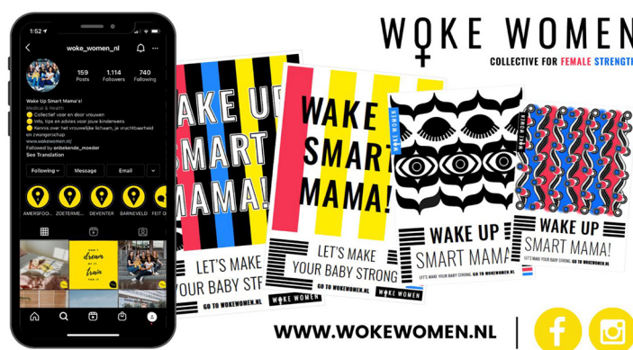
Figure 3. Look and feel of the Woke Women® materials

The development process of our social marketing strategy consisted of many steps and feedback moments. This iterative process in which we combined the expertise of