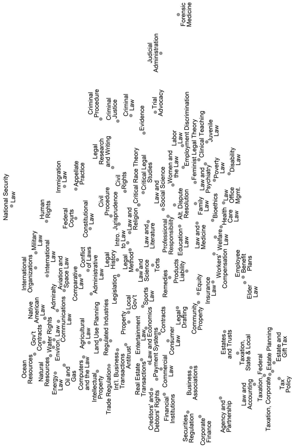
Figure 2: CSCO map most consistent with the gold-standard.