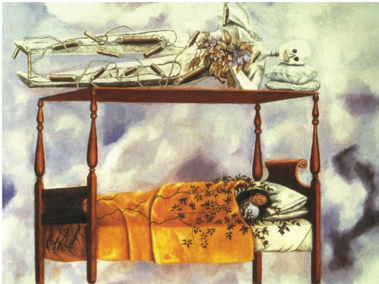
Figure 10. Frida Kahlo, The Dream (The Bed)