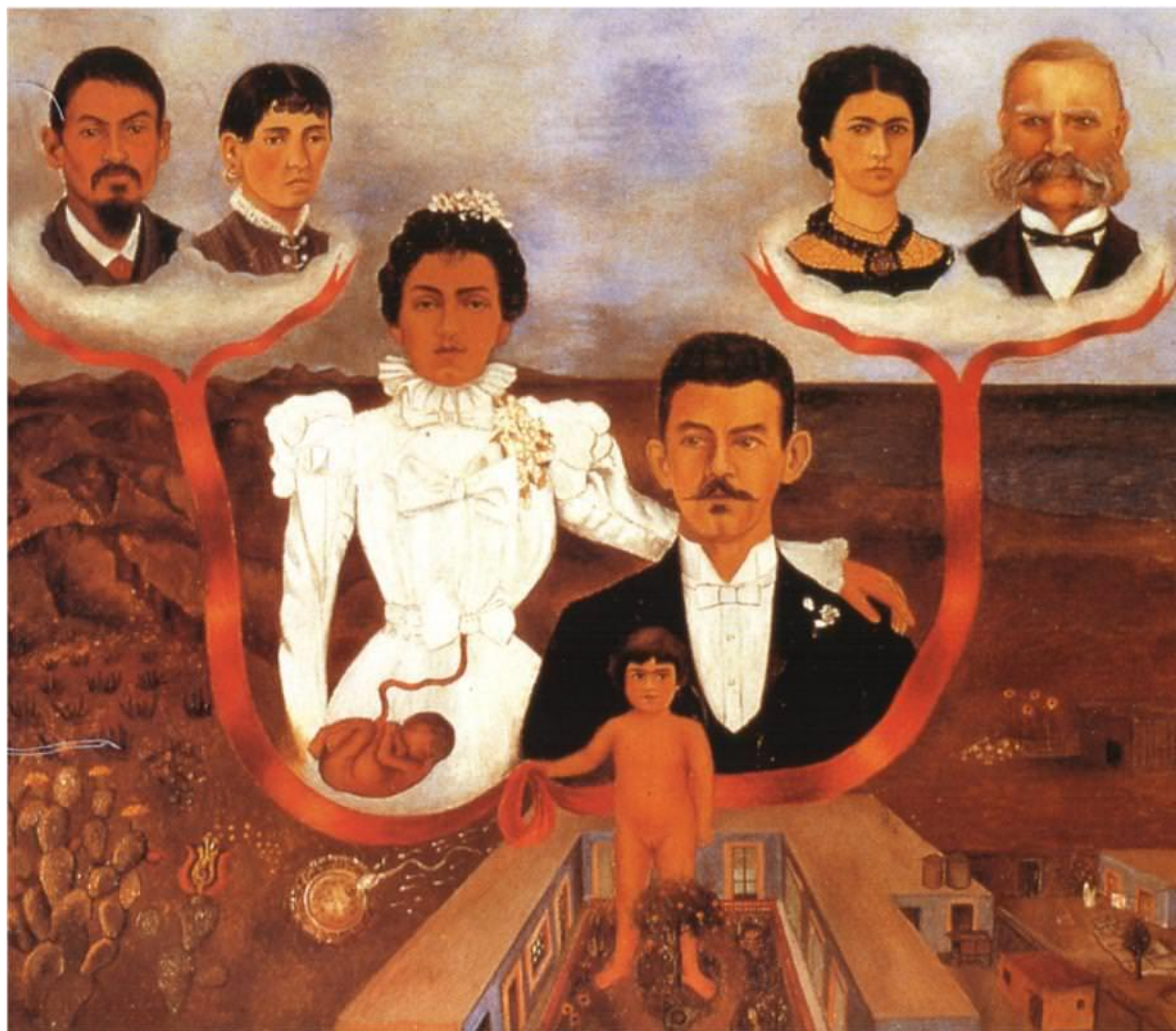
Figure 8. Frida Kahlo, My Grandparents, My Parents, and I 1936, Oil and tempera on zinc, 30.7 x 34.5 cm. Museum of Modern Art, New York City, United States.