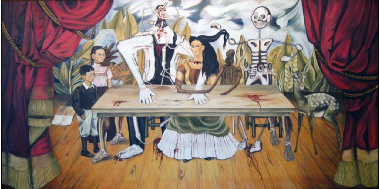
Figure 6. Frida Kahlo, The Wounded Table 1940, oil on canvas, 122 x 244 cm. Unknown.