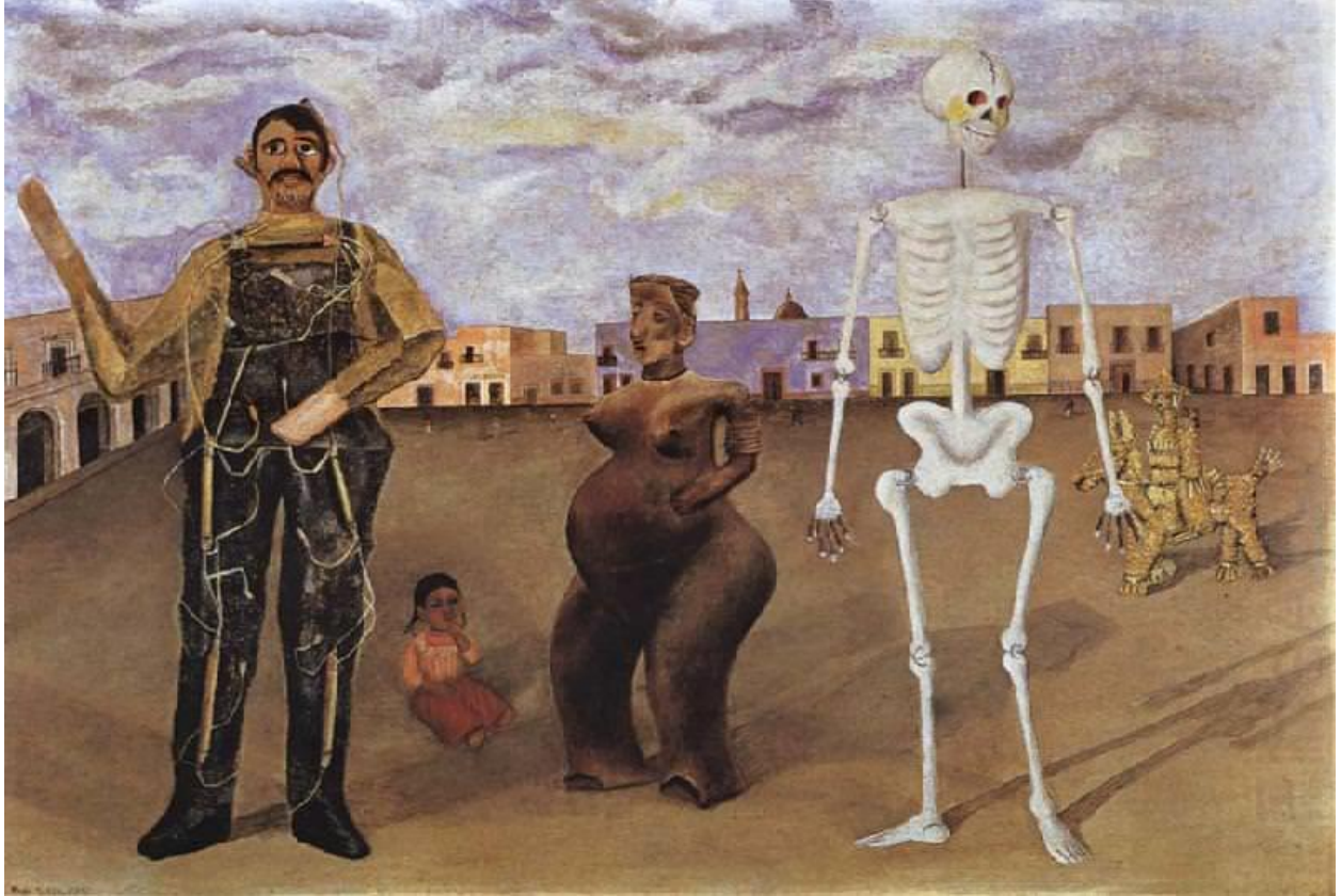
Figure 5. Frida Kahlo, Four Inhabitants of Mexico 1938, oil on metal, 32.4 x 47.6 cm.

Private collection, Palo Alto, California, United States.