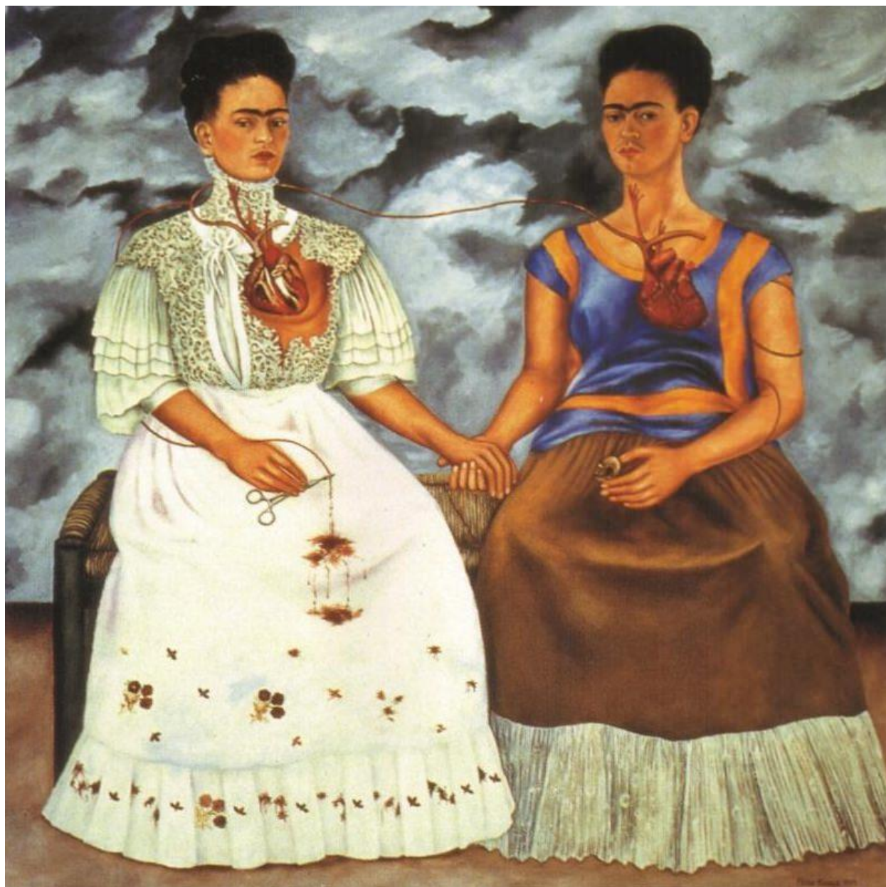
Figure 11. Frida Kahlo, The Two Fridas 1939, oil on canvas, 173.5 x 173 cm.

Museo de Arte Moderno, Mexico City, Mexico.