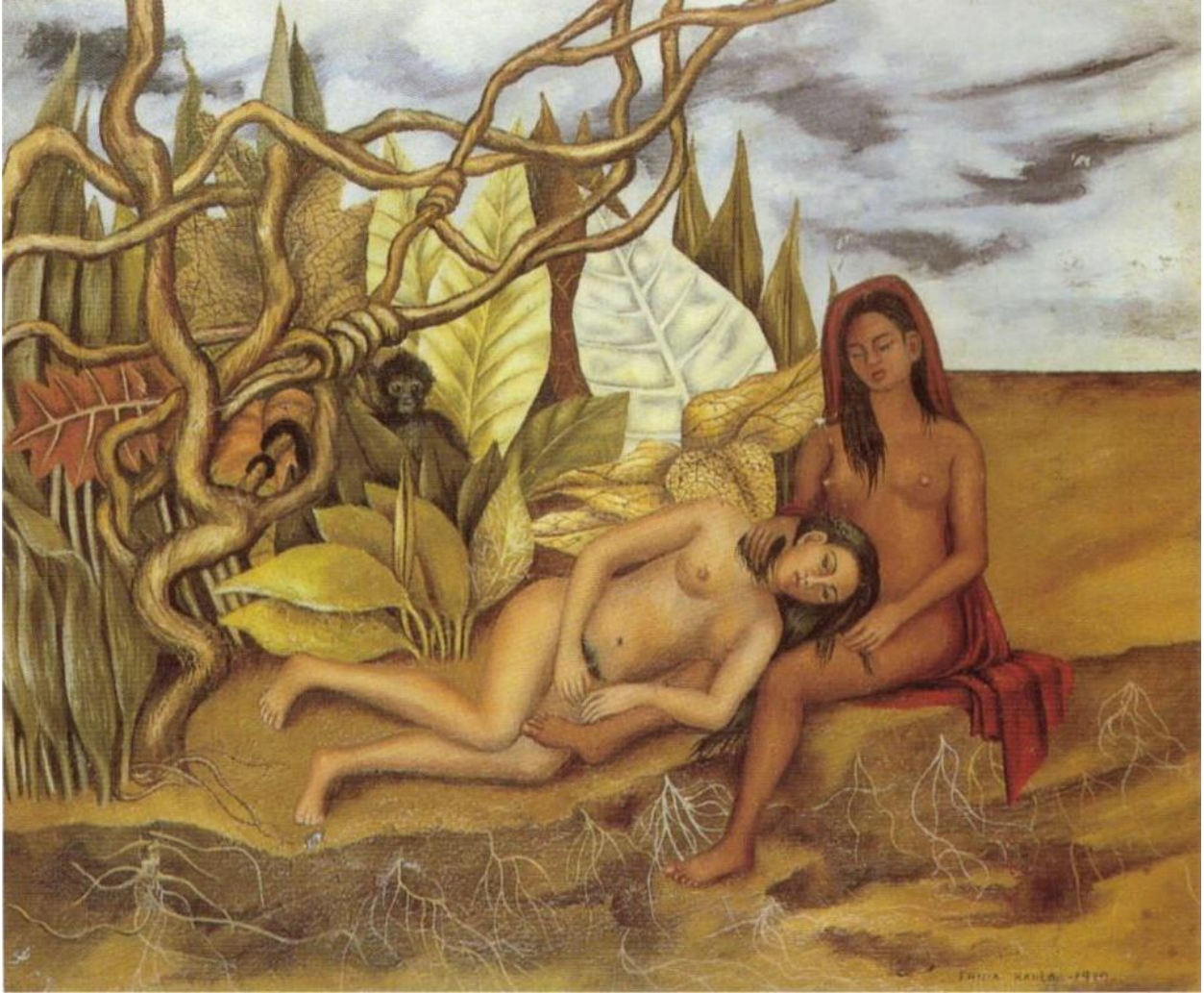
Figure 9. Frida Kahlo, Two Nudes in a Forest 1939, Oil on metal, 25 x 30.5 cm.

Collection of Jon and Mary Shirley, Washington, United States.