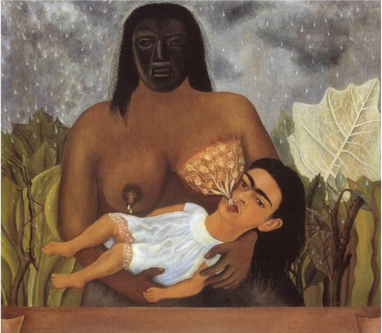
Figure 4. Frida Kahlo, My Nurse and I 1937, oil on metal, 30.5 x 36.83 cm. Museo Dolores Olmedo, Mexico City, Mexico.