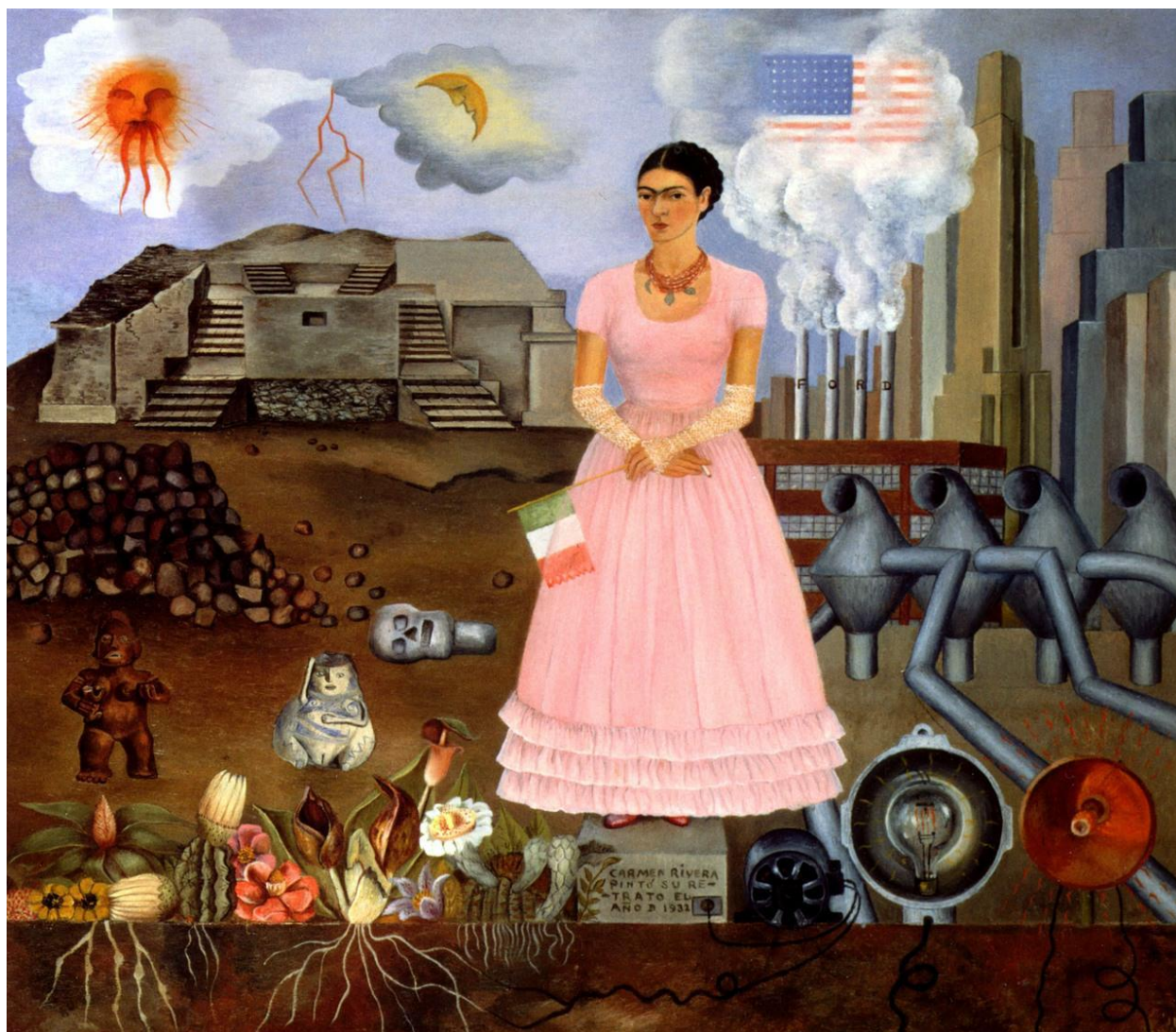
Figure 3. Frida Kahlo, Self-Portrait on the Border of Mexico and The United States 1932, oil on metal, 31 x 35 cm.

Collection of Maria Rodriguez de Reyero, New York City, United States.