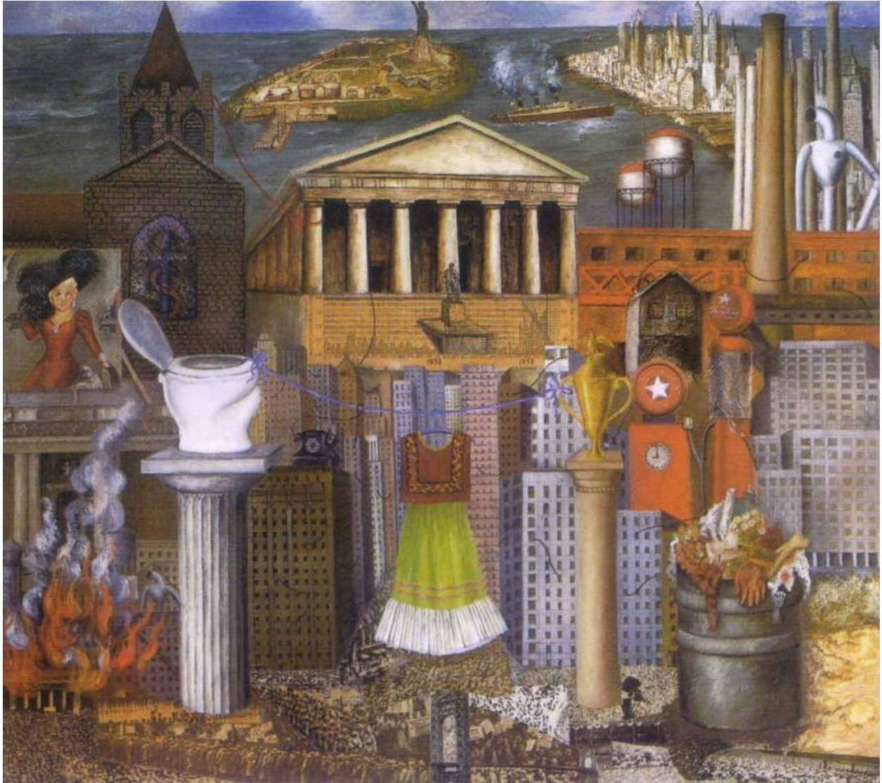
Figure 2. Frida Kahlo, My Dress Hangs There 1933, oil and collage on masonite, 46 x 50 cm. Hoover Gallery, San Francisco, United States.