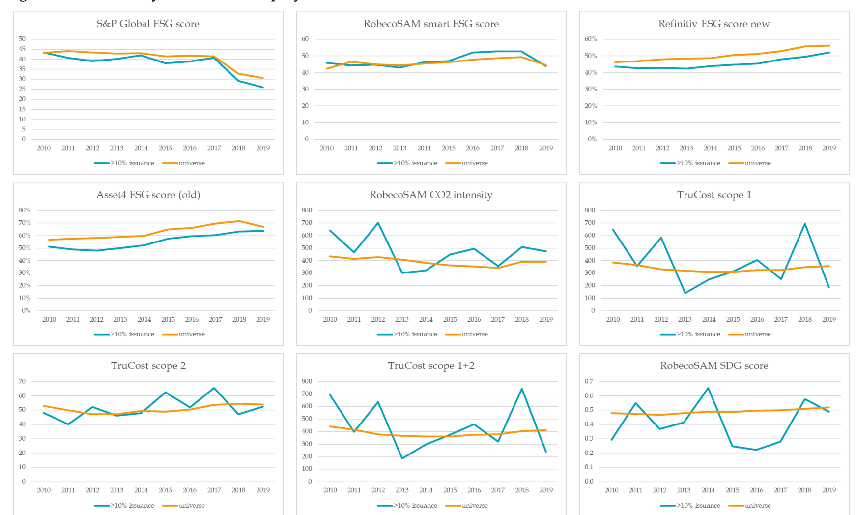
Figure 1: Sustainability characteristics equity issuers