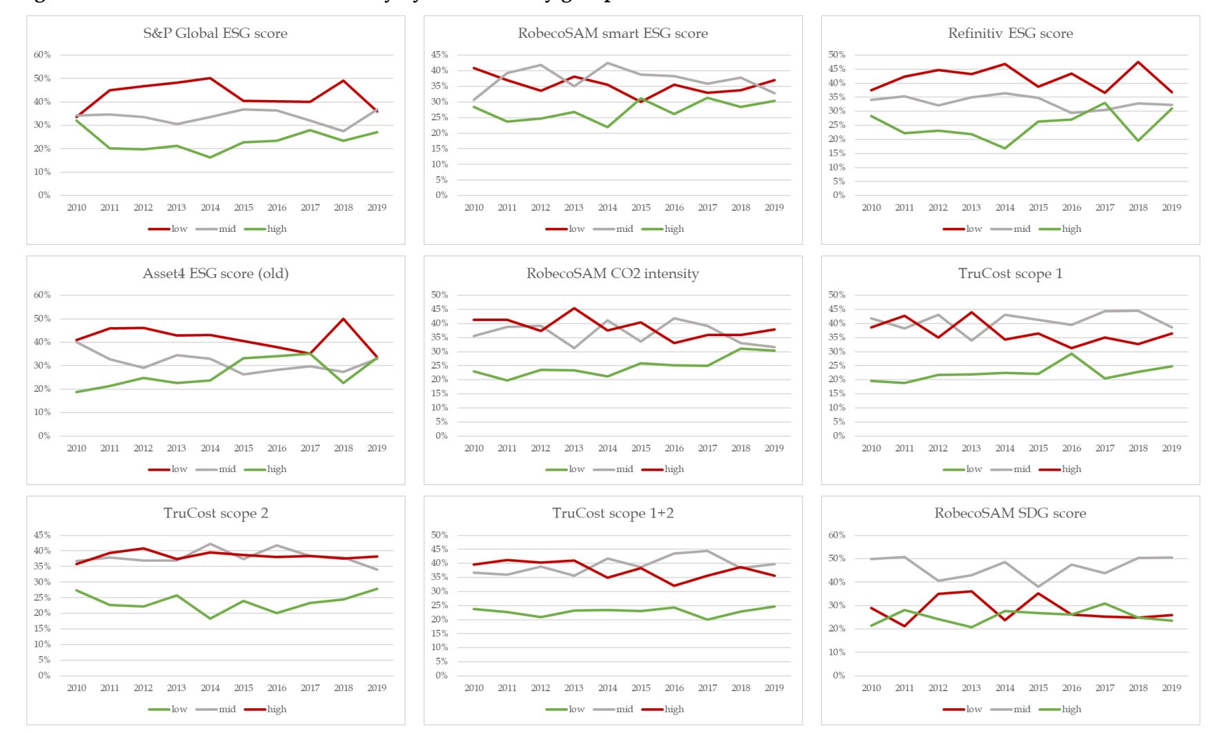
Figure 4: Relative debt issuance intensity by sustainability groups