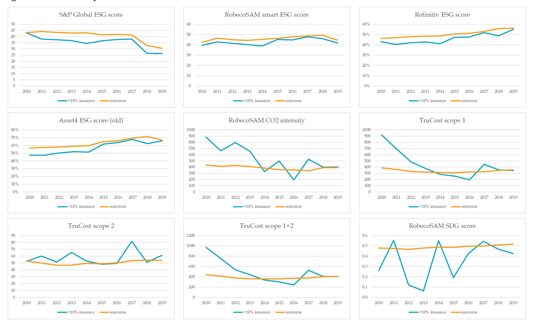
Figure 3: Sustainability characteristics debt issuers