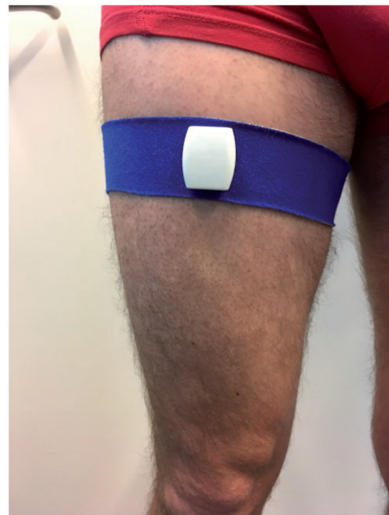
Figure 1. The position of the Activ8 when attached to the thigh.

Two independent experienced researchers checked on video whether activities for a set duration were performed consistently and without breaks. If not,