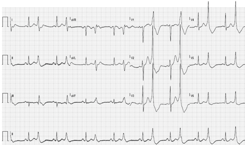
FIGURE 1: The 12-lead electrocardiogram with sinus rhythm (103 beats per minute) and frequent premature ventricular complexes in bigeminy pattern.

After therapeutic hypothermia of 24 hours, she regained consciousness with reasonable neurological recovery without apparent sequela. Furthermore, a transthoracic echocardiogram demonstrated a good left and right ventricular function and no valvular abnormalities.