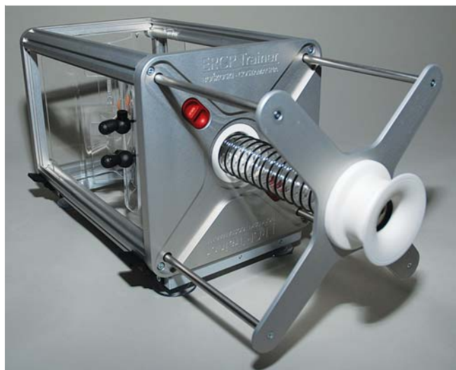
► Fig. 2 The Boškoski-Costamagna ERCP Trainer.