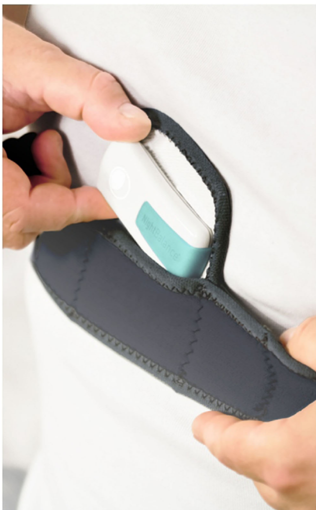
Fig. 1 Sleep Position Trainer

As active comparator, the OA was a custom-made duo-bloc device (SomnoDent flex; SomnoMed) (Fig. 2). After adequate assessment of the central relation and maximum protrusion, the OA was set at 60% of maximum protrusion at baseline. The OA was adjusted individually and advancement was titrated using a standard protocol by the dentist, which was described in greater detail elsewhere [24]. Objective adherence was measured using a temperature-sensitive microsensor with on-chip integrated read-out electronics (Theramom, Handels- und Entwicklungsgesellschaft, Handelsagentur Gschladt, Hargelsberg, Austria) with a sampling rate of one measurement every 15 min. A recorded temperature of > 30\text{ }^{\circ}\text{C} indicated that the OA was worn.