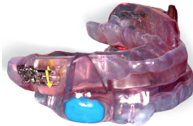
Fig. 2 Oral appliance therapy, including a blue chip for measuring adherence