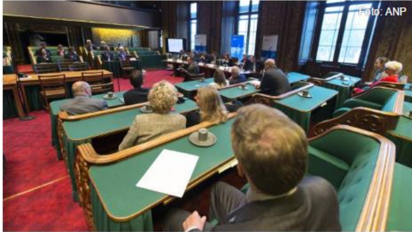
Eerste Kamer gaat akkoord met Huis voor Klokkenluiders

Gepubliceerd: 01 maart 2016 17:47 Laatste update: 01 maart 2016 17:48