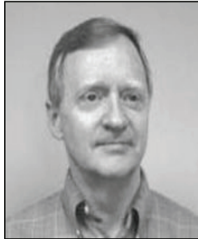
Rand R. Wilcox University of Southern California

Consider the regression model Y = \gamma(X) + \varepsilon , where \gamma(X) is some conditional measure of location associated with Y , given X . Let \hat{Y} be some estimate of Y , given X , and let \tau^2(Y) be some measure of variation. Explanatory power is \eta^2 = \tau^2(\hat{Y}) / \tau^2(Y) . When \gamma(X) = \beta_0 + \beta_1 X and \tau^2(Y) is the variance of Y , \eta^2 = \rho^2 , where \rho is Pearson's correlation. The small-sample properties of some methods for estimating a robust analog of explanatory power via smoothers is investigated. The robust version of a smoother proposed by Cleveland is found to be best in most cases.