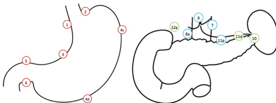
Fig. 2 Gastric lymph nodes

Secondary outcome measurements include postoperative morbidity and mortality, readmissions, cost-effectiveness, oncologic outcome and quality of life. Standardized definitions will be used for complications and include anastomotic leakage, anastomotic stricture and number of dilatations, respiratory complications, cardiac complications, chyle leakage, intra-abdominal bleeding, intra-