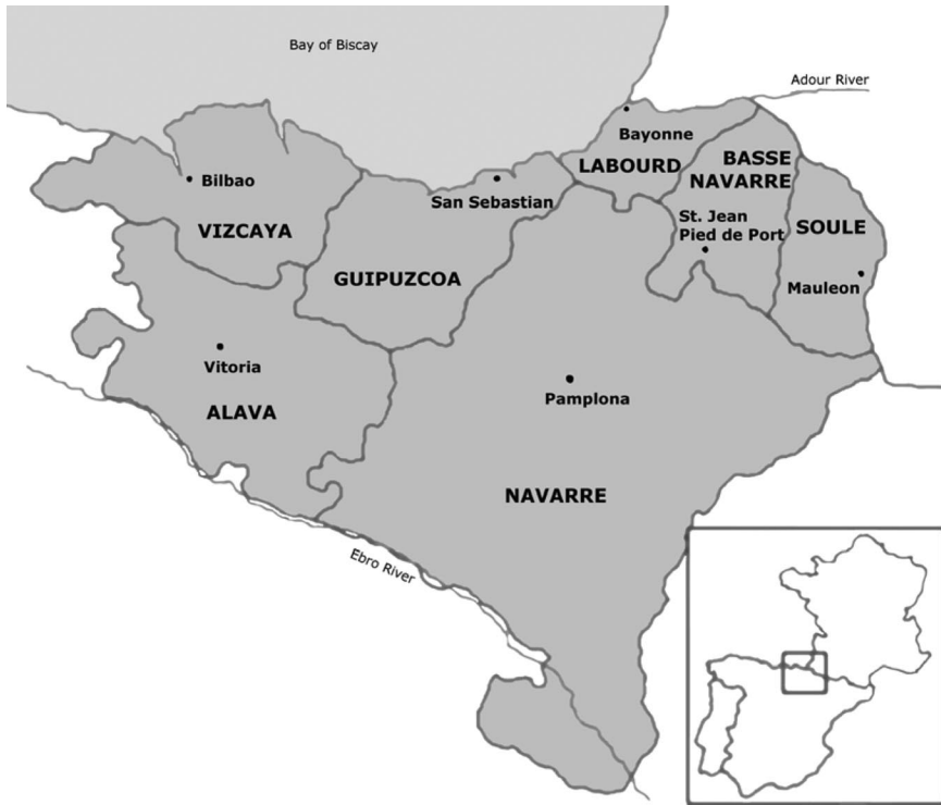
Figure 1. Map of Basque provinces in Spain and France, with locations of provincial capitals highlighted.