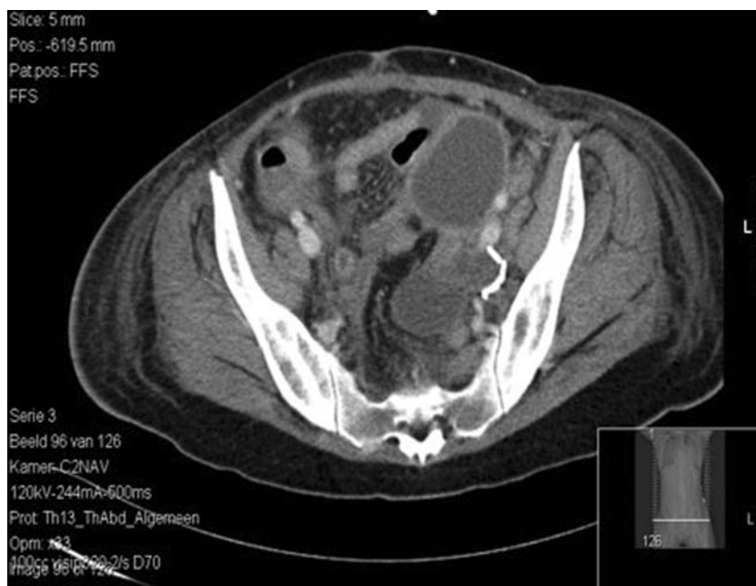
Figure 1 CT-scan abdomen with chyloma. Drain in situ in lower left abdomen.

A second laparotomy was performed aimed at controlling the chylous discharge. During this procedure, the origin of the chylous leakage was identified after provocation with an extensive amount of double cream through the nasogastric tube. Macroscopically, no tumor was present, and only extensive chylous leakage was noted from the retroperitoneum (Fig. 3). An attempt was made to occlude all lymphatic vessels from the left groin to the diaphragm