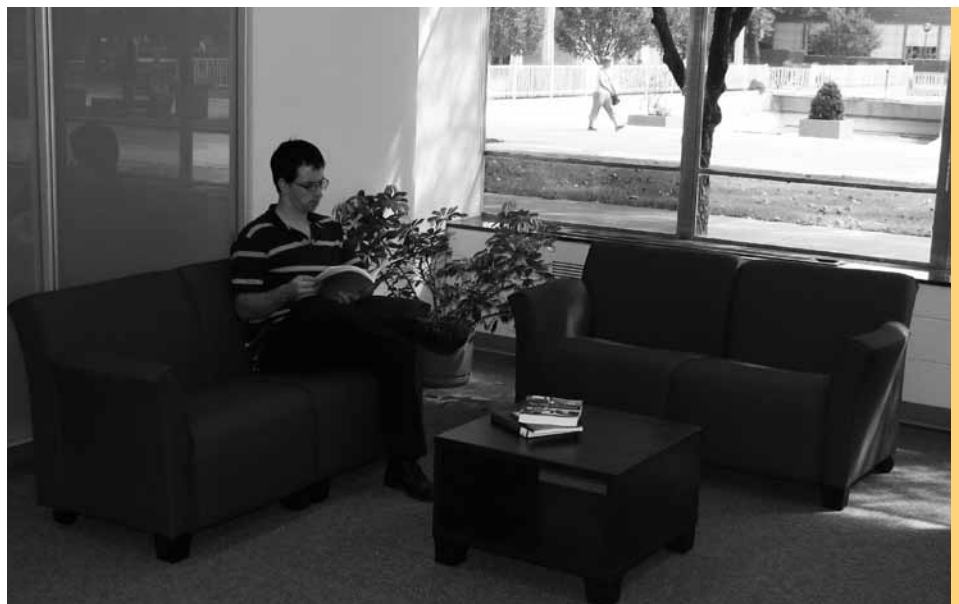
TRC Faculty Lounge

With the expansion of the Honors College further into the UGL's second