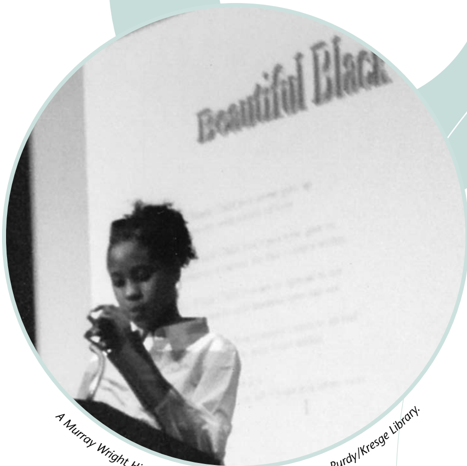
A Murray Wright High School student reads poetry at the Purdy/Kresge Library.