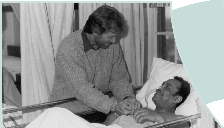
Chuck Norris visits a veteran in the 1980s