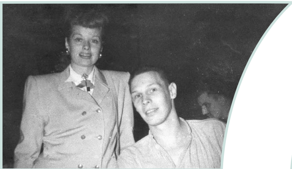
Lucille Ball with a soldier in the 1940s

DALNET includes hospitals, private academic libraries, community colleges, special libraries such as the Detroit Institute of Arts and The Henry Ford, the Detroit Public Library system and Wayne State University Libraries. DALNET members collectively serve a region of four million people.