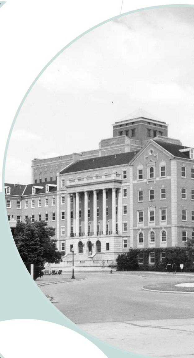
The original VA Hospital