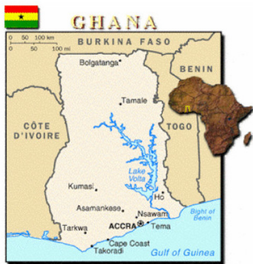
Figure 1 Map of Ghana.

prevalence rates as high as 33% in some communities [3,4]. The increasing prevalence of hypertension is well reflected in the increasing stroke and cardiovascular disease morbidity and mortality [7-9].