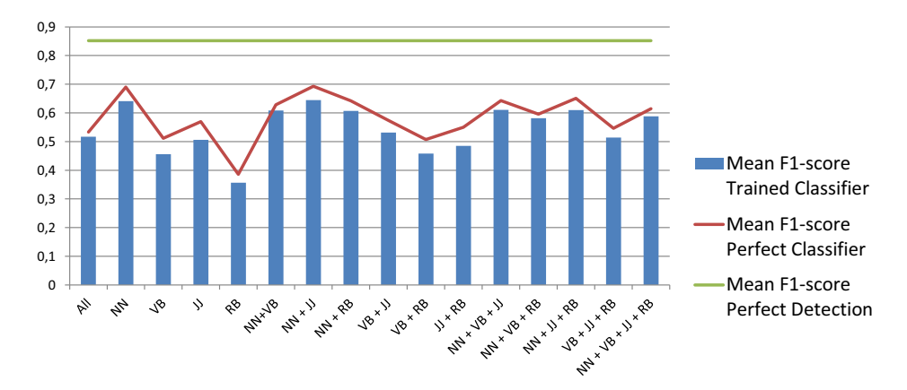
Figure 3. Mean F_1 -scores with different part-of-speech filters [5].

line). The scores using a perfect classifier are computed by always passing the correct prediction (in terms of the presence of multiple implicit features) onto the feature detection algorithm. The scores with the perfect feature detection are found by, based on the prediction of the classifier, assigning a number of golden implicit features to the sentences.