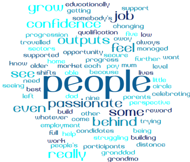
Figure 4 Values Question - Words >3

For me it is about knowing that I am trying to help somebody's grandma, granddad, mum, dad because what would I want for my parents, or even me as I get older? (Navigator 1)