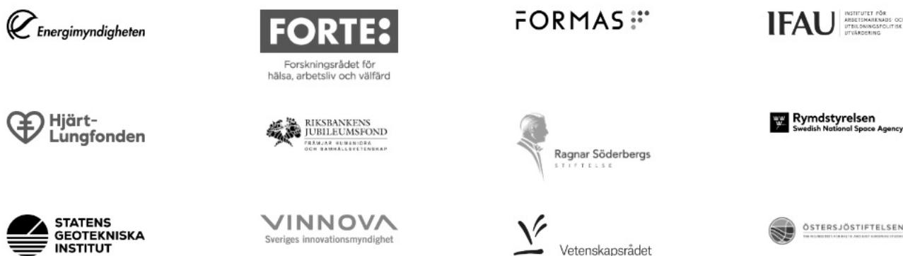
Figure 2. Swedish research funders (public and private) involved in SweCRIS

systems for collecting this kind of research information from funders. The fact that the standards for information exchange between the funders' systems and the SweCRIS national portal are directly discussed and agreed with funders means they are brought into a national-level research information management community that can also be a very useful forum when discussing PID implementation.