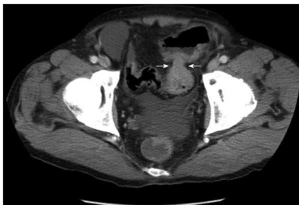
Figure 2 Computed tomography revealed sigmoid colon cancer. The white arrows indicated the site of stenosis due to the cancer.

should be chosen to reduce the pressure with which the tube presses against the organization. Friedman et al. [15] reported that midline tube placement generated severe inflammation in the post-cricoid region more often than lateral tube placement. A long intestinal tube with a large diameter might be more easily placed in the midline than a NGT and lead to NTS.