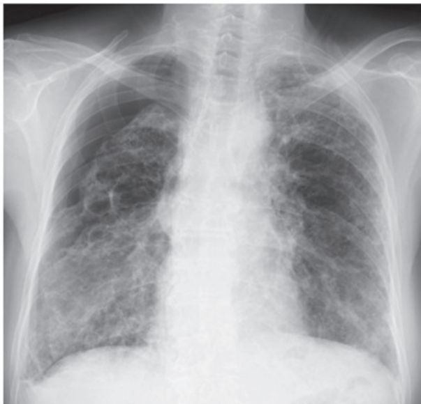
Figure 2. Chest radiograph reveals right lung pneumothorax, and reticulonodular opacities predominant in the bilateral lower lungs.

the Ethics Committee of the Mito Medical Center, University of Tsukuba-Mito Kyodo General Hospital (Mito, Japan). Informed consent was obtained from the patient.