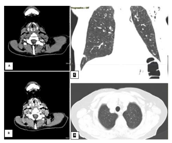
Figure 4. CT scan on the left. The neck scan revealed the presence of small submucosal bilateral glottic masses, associated with increased cervical lymph node volume, without subglottic and extra laryngeal extensions. (A) Axial section basal CT scan on the left. (B) Axial contrast-enhanced CT on the right. Lung window showing a small scar at the level of the right lower lobe from previous pneumonia reported by the patient; (C) coronal and (D) axial lung window). Due to the worsening conditions, the patient was mechanically ventilated because of acute respiratory failure. Despite the therapy and mechanical ventilation, the pulmonary functions deteriorated progressively, resulting in the patient's death. The patient was not diabetic, hypertensive, or cardiopathic and was not a smoker. By anamnestic clinical history, we discovered that two years before this event (October 2019), the subject presented mild hoarseness of voice. At the time, an endoscopic laryngeal examination revealed bilateral mobile vocal folds without apparent abnormalities. For further confirmation, the subject underwent a laryngeal exam under general anesthesia, which showed the absence of any macroscopic lesion, and the histopathological results of the biopsies were negative. The physicians scheduled a follow-up after three months, but unfortunately, the lockdown caused by the COVID-19 pandemic and the fear of viral infection prevented her to attend the recommended follow-up visits. The patient was COVID-19-negative throughout the whole illness (Table 1). We performed a literature analysis by searching the PubMed database for 'laryngeal adenoid cystic carcinoma'. We did not limit the search to article types because of the rarity of the disease and the little number of papers about it. We choose only papers published in English within the past five years. The articles in the database whose full text could not be found were also excluded. The title and abstracts of the identified manuscripts were initially screened and selected by all authors independently (IF, AC, PGM, HE, RA, MF, MR, DM, AG, MdV, CB, and AM) based on their relevance to the review topic. The following set of shared chosen inclusion criteria was applied individually to the selected articles in their full-text version: primary laryngeal affection of adenoid cystic carcinoma and therapy consensus of LACC. The literature search yielded 48 papers. Subsequently, 28 studies were excluded because they did not meet the objective of our review, and 20 studies were included and discussed (Figure 5 and Table 2).