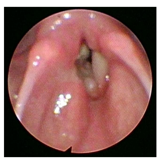
Figure 1. Endoscopic view of the larynx showing the lesion. The adenoid cystic carcinoma (ACC) arises from the minor salivary glands. It accounts for 1-5% of all head and neck malignancies. Since the minor salivary glands are present in small amounts throughout the larynx, the laryngeal adenoid cystic carcinoma is sporadic, representing less than 1% of all laryngeal malignancies [1]. Regarding the onset of laryngeal ACC (LACC), the prevalent age ranges from 50 to 60 years. However, younger generations can be affected, and both sexes are equally affected, with a slight male predominance and a male-to-female ratio of 1.5:1. There is no evidence connecting LACC etiology with smoking. An early perineural and hematological spread make this kind of carcinoma liable for local recurrence and distant metastasis, especially to the lung. Therefore, is important to increase the frequency of controls during follow-up [2]. Laryngeal ACC can originate from any part of the larynx. The most common origin is the subglottic area (64%), followed by the supraglottic area (25%), the glottic area (5%), and the trans-glottic area (6%) [3,4]. The clinical presentation is usually variable and related to the lesion location [5-7]. In November 2021, a 70-year-old no-smoker female patient presented to our hospital's emergency department with stridor, severe dyspnea at rest, and hoarseness of voice. The O2 saturation level was 87% on air without cyanosis. An endoscopic laryngeal examination revealed bilateral vocal cord paralysis in adduction. Firstly, the patient underwent an urgent tracheostomy under general anesthesia. The procedure also included a laryngeal examination (micro-laryngeal surgery) under general anesthesia with tumor mapping, which revealed a bilateral mucosal thickening of the anterior thirds and anterior commissures of both vocal folds and a right vocal fold submucosal thickening (Figure 1). Multiple biopsies from different laryngeal areas were taken for histopathological examination. The pathological tissue revealed the presence of an adenoid cystic carcinoma of the solid type associated with the immunophenotype CK AE1 AE3 +, CD117+, CK7+/-, p63 +/-, p40+/-, Vimentin +/-, SMA+/-, S100+/-. Then, the patient underwent a CT scan of the neck chest and brain with a contrast medium and an abdominal ultrasound examination. The first chest, brain, and abdominal radiological evaluations did not show metastatic lesions. The neck CT scan revealed the presence of small submucosal bilateral glottic masses, associated with increased cervical lymph nodes volume, without subglottic and extra-laryngeal extensions (Figure 2).