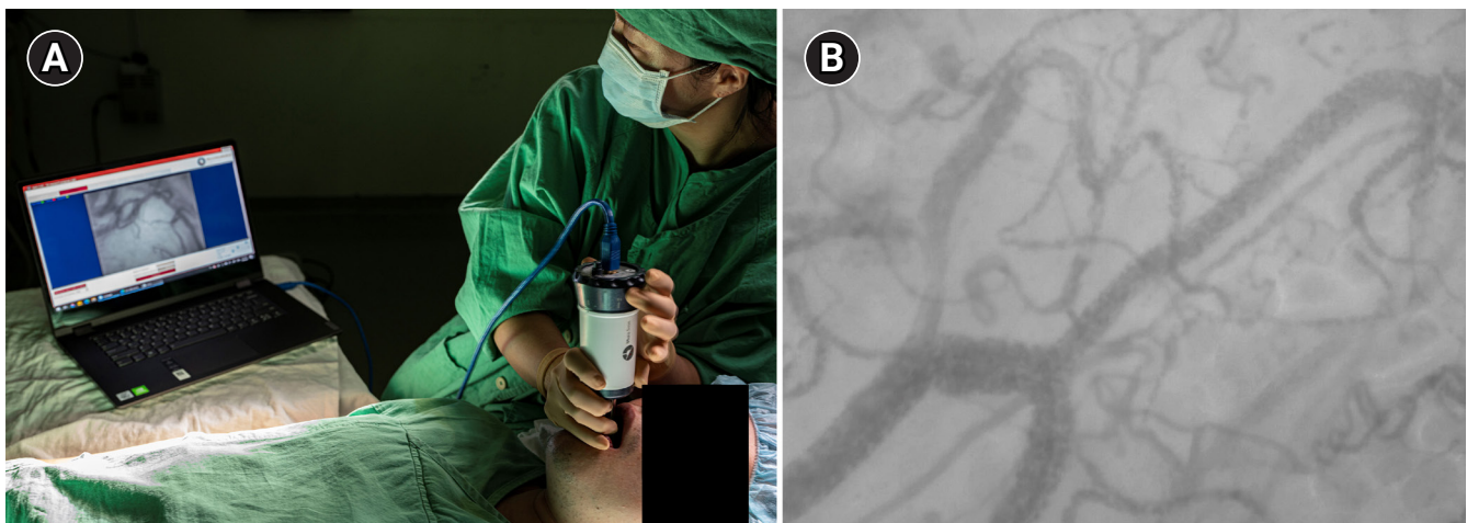
Fig. 1. Direct inspection of microcirculation and video acquisition from the sublingual mucosa (A); images are stored in a computer, which is connected to a handheld vital microscope (B).

Images obtained using an HVM can be analyzed with (a)