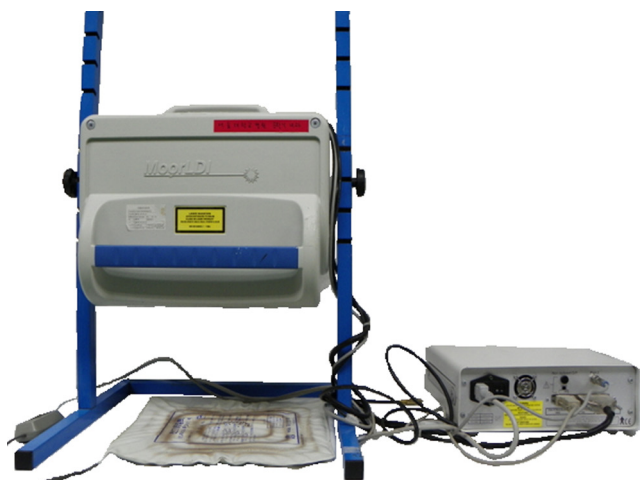
Fig. 3. A laser Doppler flowmetry device (MoorLDI, Moor Instruments Ltd., UK) for microcirculatory evaluation. Visualized objects such as the hand or foot is placed under the imager like X-ray shooting.

Unfortunately, LDF does not provide absolute microvascular blood flow values in individual vessels or vascular heterogeneity [7,35]. Furthermore, the ability to reflect actual microcirculatory alterations, not just changes in regional blood flow, is questionable [42].