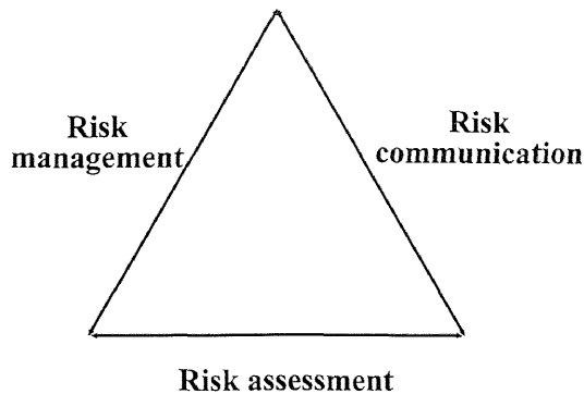
Fig. 1. The functionally distinct but highly interactive and iterative processes in risk analysis. Risk assessment provides the scientific basis for analysis. It paves the way for managing risks through appropriate measures that, if and when modified, might require a re-assessment of risks. Risk communication is needed throughout the process of risk analysis.

bodies and risk management agencies is essential.