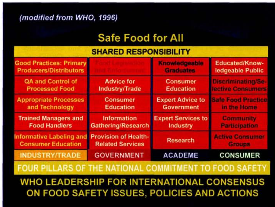
Fig. 3. Academe as a key partner in ensuring food safety for all (adopted and modified from WHO, 1996).

The multifaceted nature of food safety requires a seamless interface among stakeholders (Fig. 3), and university-based experts can make significant contributions towards ensuring that the interface is supported by risk-based knowledge. However, a holistic approach to food safety cannot be achieved