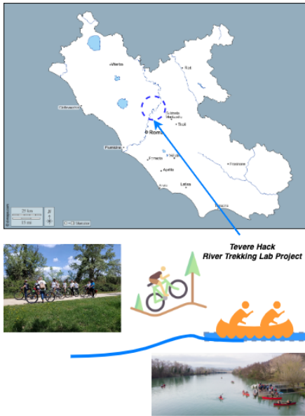
Fig. 2. Smartourism Hackathon Organization