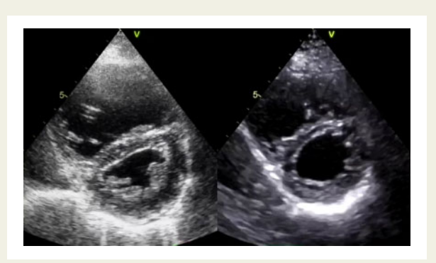
Video I Short-axis parasternal view, baseline (left panel) and under tailor-made treatment sSGC (right panel).