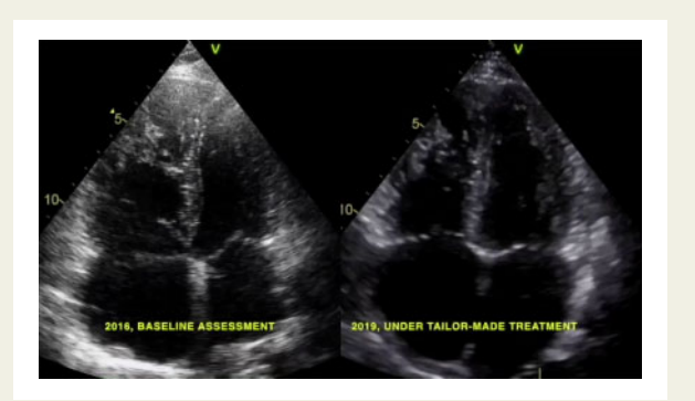
Video 2 Four chambers apical view, baseline (left panel) and under tailor-made treatment (right panel).