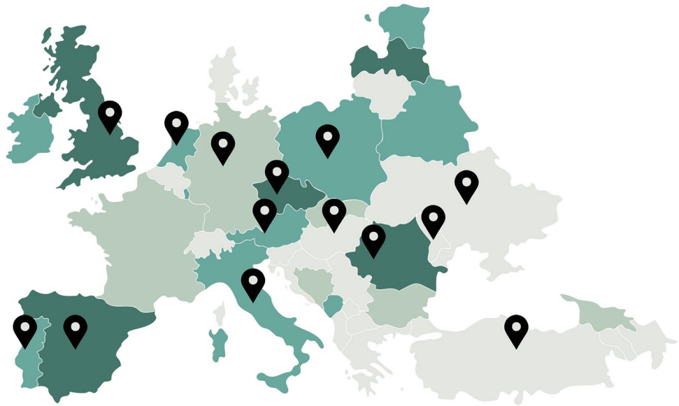
Fig. 2 Map of the countries participating in the survey. Each pointer represents one or more participants

milestones along the path to becoming a physician. It was during the sixteenth and seventeenth centuries that specific spaces, housing anatomical and pathological specimens were instituted with the aim of teaching medical students [4]. Pathological collections substantially improved when the fixation techniques, devised by Johann Carl Kaiserling (1869–1942) and Leonhard Jores (1866–1935), allowed the natural colours of moist preparations to be maintained or restored for long-term display [5].