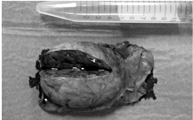
Fig. 2. Photograph of the tumor.

One month after the caesarean section, the patient was referred to our Department to perform the laparoscopic right adrenalectomy (LRA). The day before surgery, she received 1500ml of physiologic saline solution for prevent a sudden episode of hypotension after removal of the tumor. The surgical approach was laparoscopic transperitoneal right adrenalectomy: the patient was placed in a modified flank position, 45 degrees back from vertical, three ports were used in triangulation in subcostal position and an additional fourth port for the liver retraction on subxiphoid site were positioned. During surgical procedure we found difficulties related to the position of the gland (right adrenal gland): proximity to the inferior vena cava and moderate adhesions to the hepatic margin and to right kidney. During adrenal gland manipulation and adrenal vein dissection, the