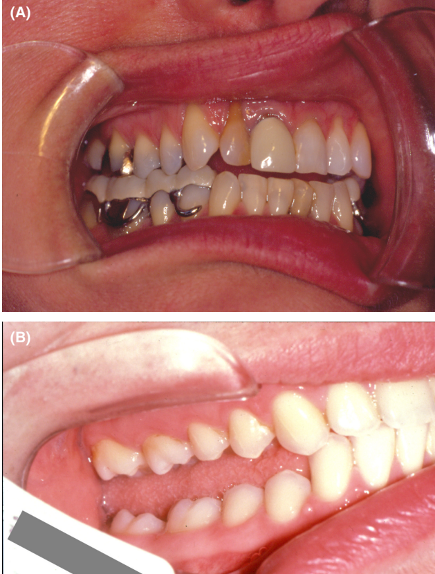
FIGURE 1 Back in the '80s, some practitioners used MORA appliances to manage TMDs (A). Those kind of devices carried the risk for iatrogenic posterior open bite (B)

use; OA articles are governed by the applicable Creative Cor