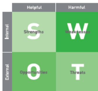
Figure 5. The SWOT analysis [21]

Outlining these strengths help marketers to focus on them and attract more customers. Promotions could be based on strengths outlined in this section.