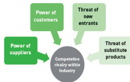
Figure 4. Porter's Five Forces Model [16]

When this power is high, the suppliers have the overall control over the business. This is likely to happen when dealing with unique products or services or when there a limited number of suppliers.