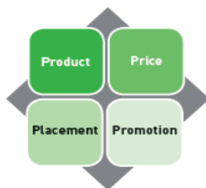
Figure 3. The Market Mix Model [14]