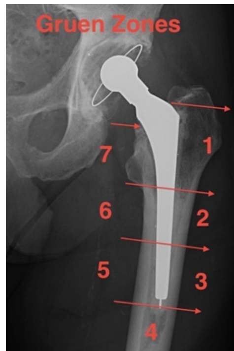
Figure 2 Native X-ray with marked Gruen zones