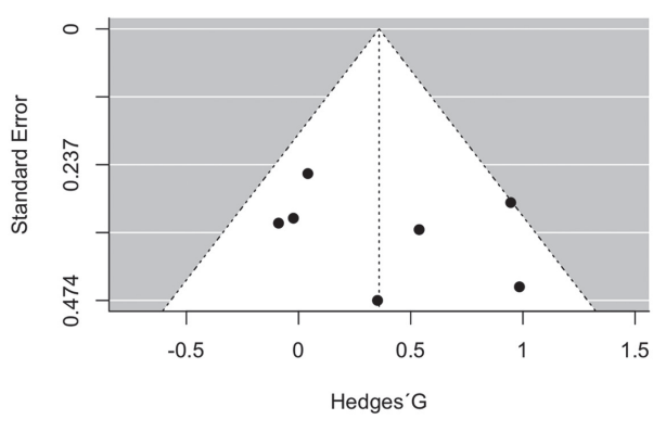
Figure 2. Funnel plot of the included studies.

Note. Items in the PEDro scale: 1 = eligibility criteria were specified; 2 = participants were randomly allocated to groups; 3 = allocation was concealed; 4 = the groups were similar at baseline regarding the most important prognostic indicators; 5 = blinding of all participants; 6 = blinding of all therapists who administered the therapy; 7 = blinding of all assessors who measured at least one key outcome; 8 = measures of one key outcome were obtained from 85% of participants initially allocated to groups; 9 = all participants for whom outcome measures were available received the treatment or control condition as allocated or, where this was not the case, data for at least one key outcome; 11 = the study provides both point measures and measures of variability for at least one key outcome.