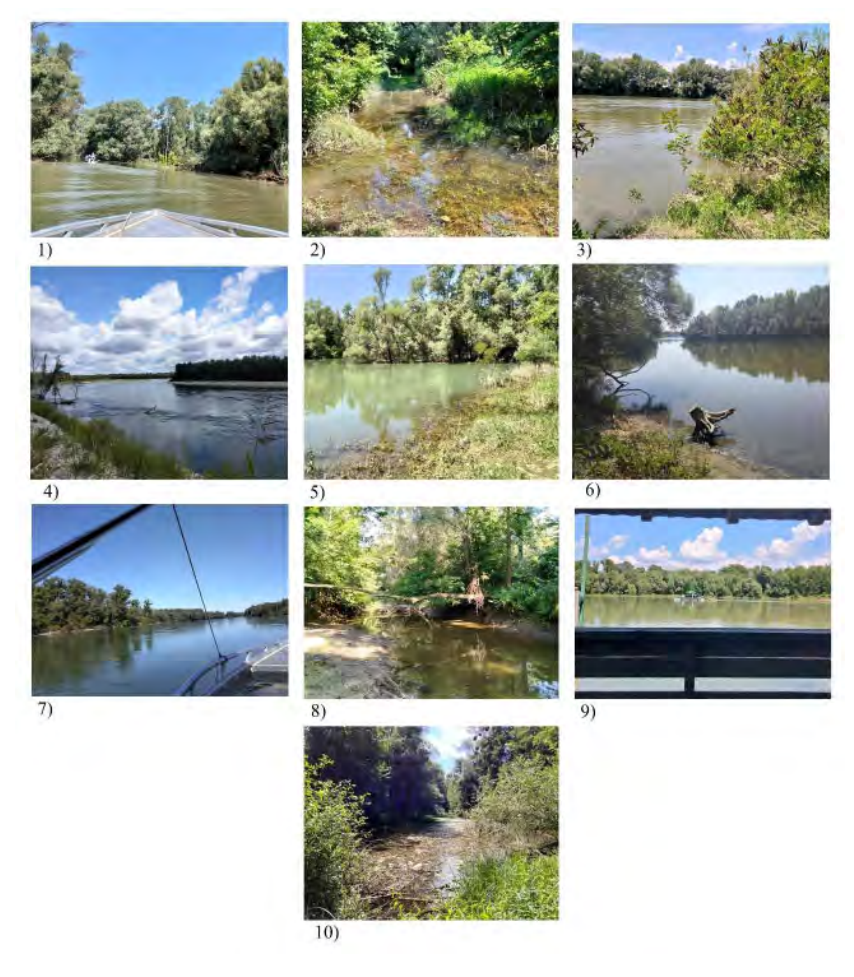
Figure 2 Study sites included in the Odonata survey at habitats around the Drava River's lower reaches (study site numbers correspond to those in Table 1).

Slika 2. Lokacije istraživanja faune vretenaca na staništima oko donjeg toka rijeke Drave (brojevi lokacija istraživanja odgovaraju onima u Tablici 1).