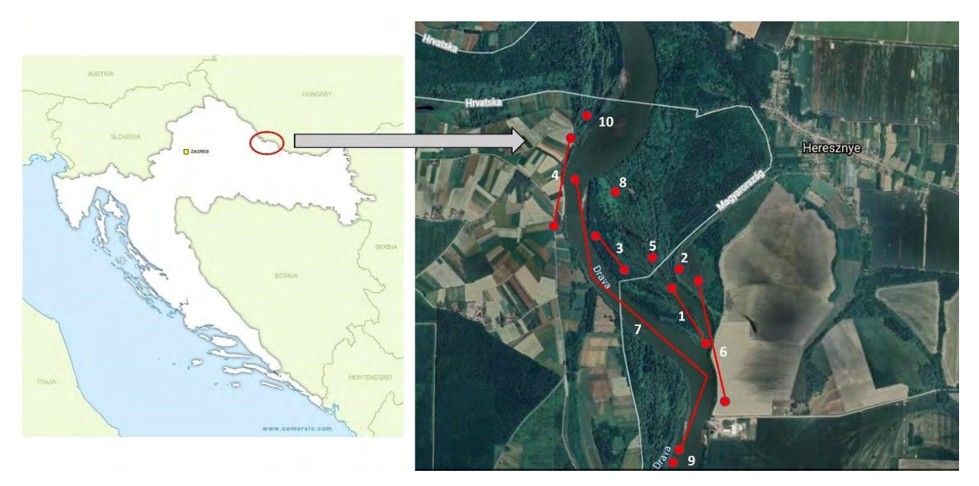
Figure 1 Study area position with the map of the study sites (study site numbers correspond to those in Table 1).Slika 1. Položaj područja istraživanja s kartom lokacija istraživanja (brojevi lokacija istraživanja odgovaraju onima u Tablici 1).