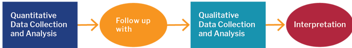
Figure 1. Explanatory Design