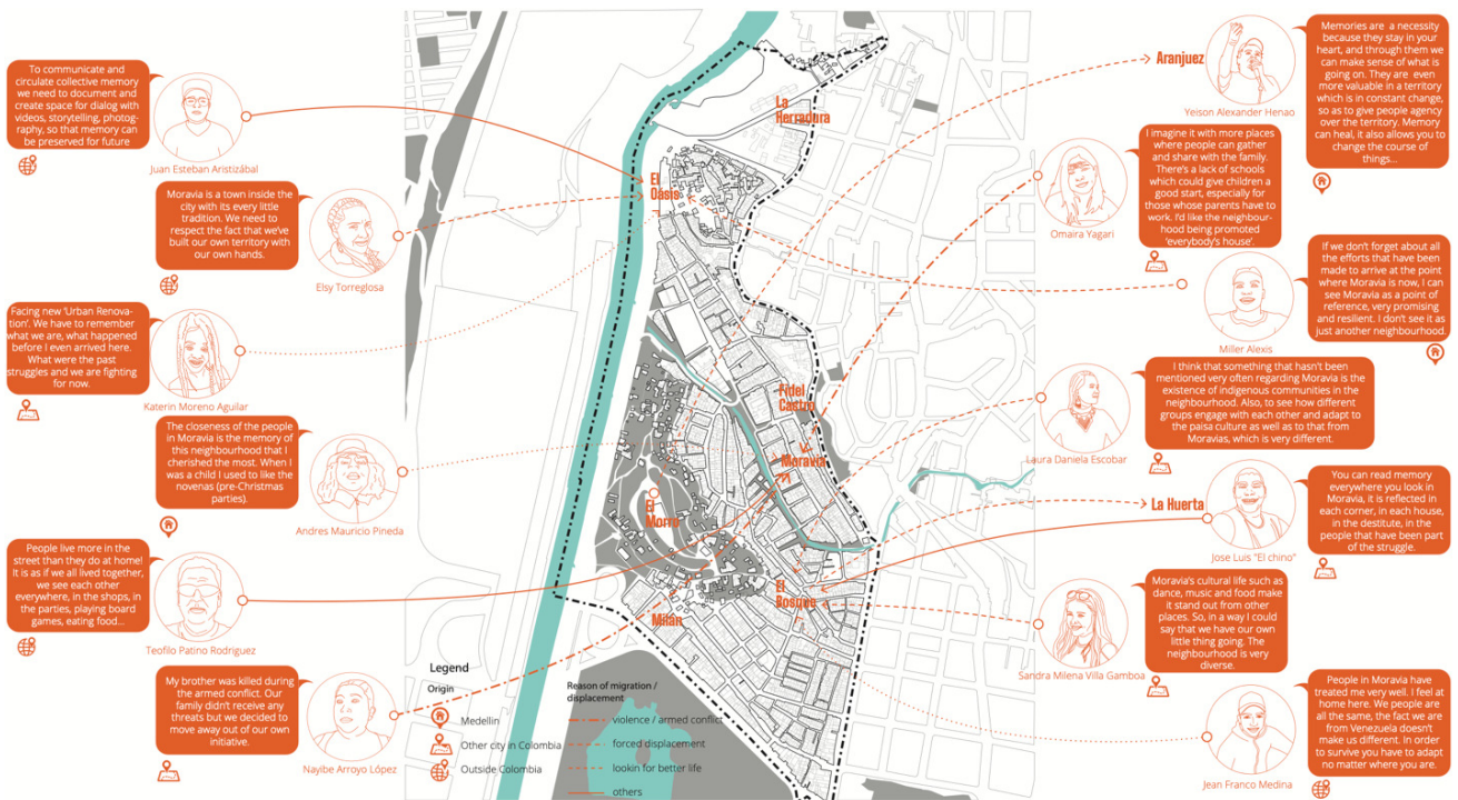
Figure 2. Life stories of migration. Source: Drawn by Memory and Migrations Team cohort 2019–2020 for Atlas of Living Heritage.

Moravia Resiste struggle after completing a workshop where I learned what the urban renewal proposal meant. Moravia Resiste, for me, is a platform of resignification where you question all the things that are taken for granted. We try to find that meeting point where we rely on the academic part to deconstruct what has been built and review what exists. Within this process, Moravia Resiste became my family.