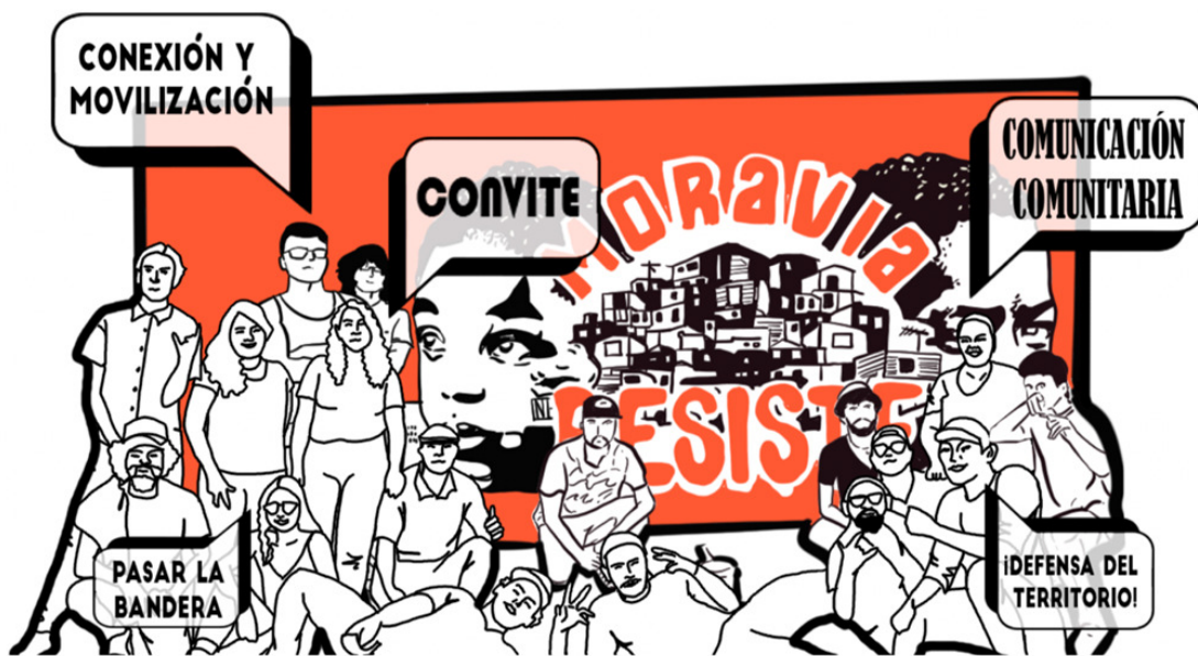
Figure 3. Moravia Resiste Collective.

The conversations with the members of Moravia Resiste highlighted the intergenerational dynamic of the collective. Moreover, it was important to understand the mobilization strategies through their trajectories of communication dynamics, places, activities, and even objects (the bicycle and the megaphone, the pot and the spoon, the audio mixer, etc.). Thus, the co-creation process needed to allow for collective stories to emerge.