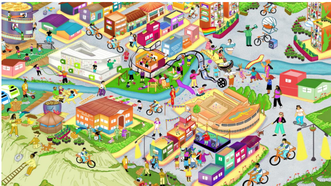
Figure 1. A re-imagined Moravia for the living heritage atlas, drawn by Miguel Mesa for Patrimonio Vivo | Living Heritage project.

The phase of engagement relied on synchronous sessions and asynchronous activities during four to five weeks of intense collaboration. Around 120 participants were part of this collaborative process, with 60 members active each year. Each team was assigned a thematic lens and had 15 members on average: Of these, two to three members were community leaders, two to three members were CDMC staff, two were COONVITE members or volunteers, and six to eight were UCL students. Given that participants were spread in different time zones, we had a rhythm of three plenary encounters of two to three hours per week, in which we framed the scope of the phase, providing guests’ thematic inputs and tutorials for each team’s work. The co-design process was built as an incremental progression on understanding the challenge and teamwork dynamics to substantiate the proposal of multi-scale socio-spatial strategies. Each team defined their work plan and a distribution route of the