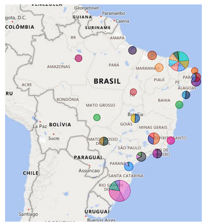
Figure 1 Hospitals participating in the survey by size classification.

the platform and (iii) to follow the International Health Regulations.<sup>21</sup>