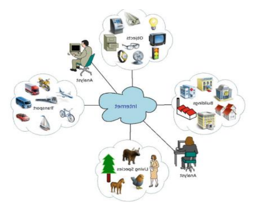
Fig. 2: Wireless Sensor Network Applications