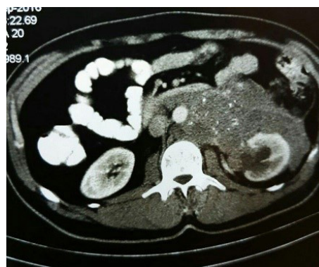
Figure 1. Huge retroperitoneal mass with invasion to the left kidney.

This is a very challenging and rare presentation of testicular GCT. Late recurrence usually defined as later than 2 years. In our case relapse was occurred 27 years after the first presentation. Following improvement in the treatment of cancers and increasing life span of these patients, however, several reports of very late relapse