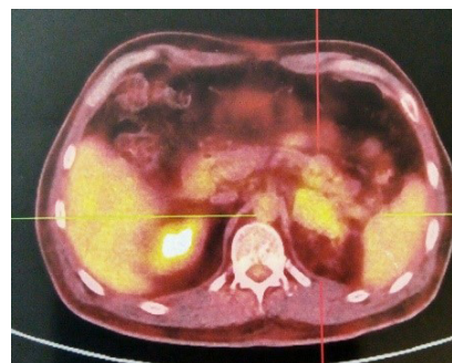
Figure 3. Residue of tumor in medial of left kidney.

of cancer patients such as renal cell carcinoma, breast cancer and pancreatic cancer have been reported (7-9). This suggests a necessity to a lifelong follow-up in these patients (7-9). The optimal duration of follow-up for GCT is not clear. Some advocates a lifelong follow-up only in patients who initially presented with metastatic disease, since this subgroup had a higher incidence of late relapse (10). In this patient a viable residue was remained after chemotherapy because of the teratoma part of tumor that was refractory to chemotherapy. In this case if recurrence was diagnosed earlier, treatment of the disease was much easier. This tumor has a hypervascular structure too. Hence, another point is a risk of bleeding with biopsy. In this patient with core needle biopsy a life