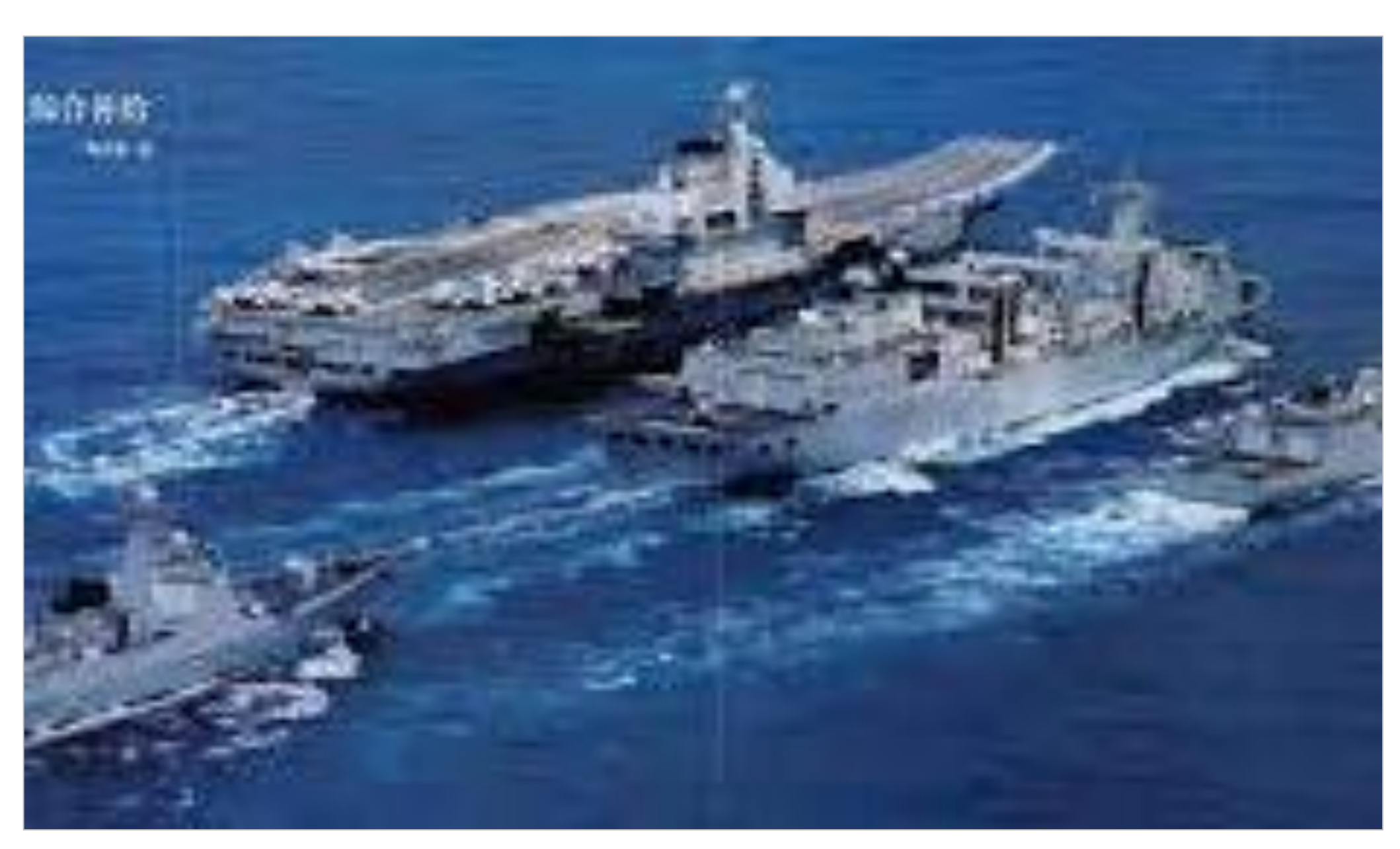
China continues an aggressive expansion of its navy in 2021-22.