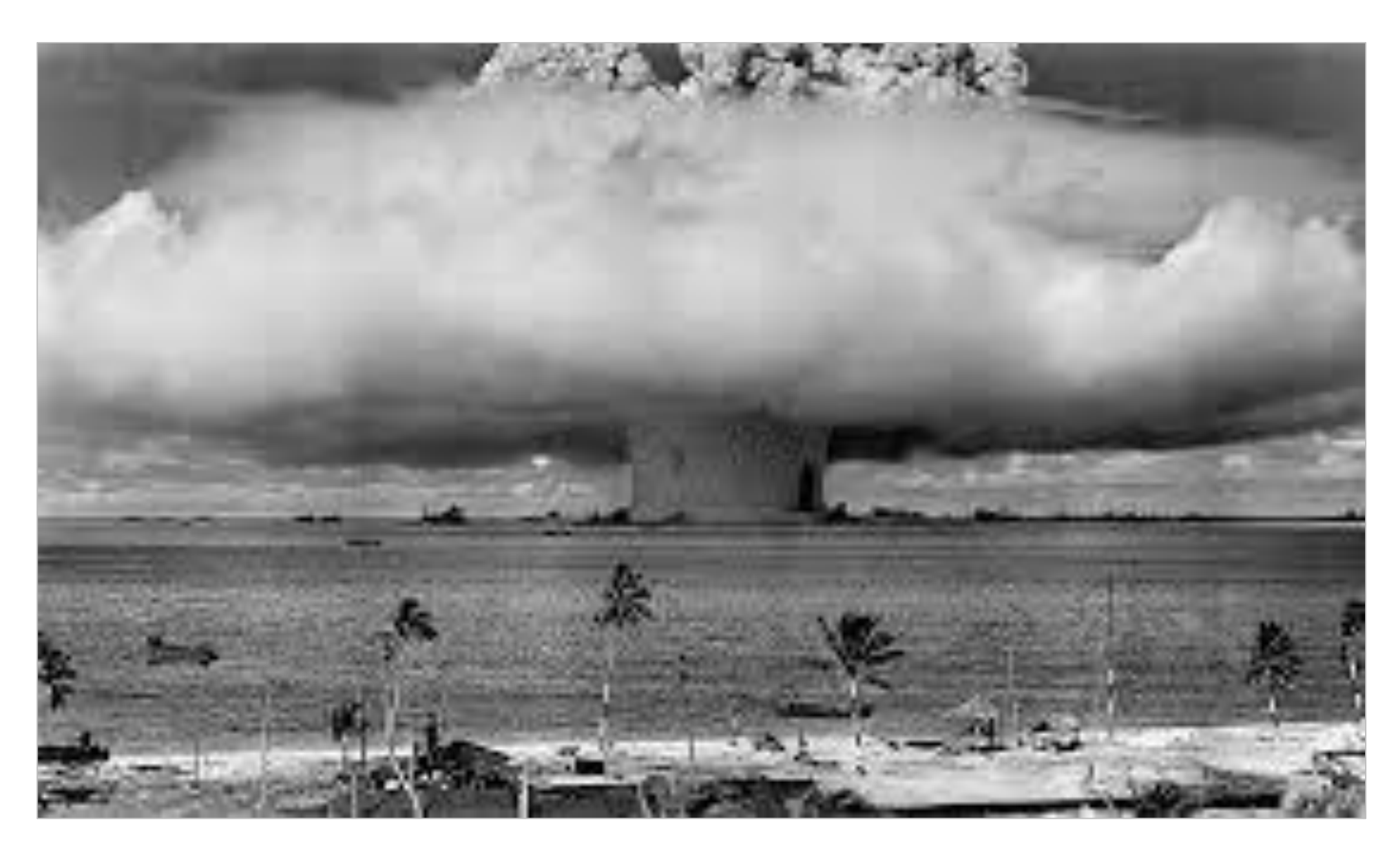
In July 1946 Navy tested two devices at Bimini Atoll in the Pacific, including a variety of surface ships to assess damage and effects.