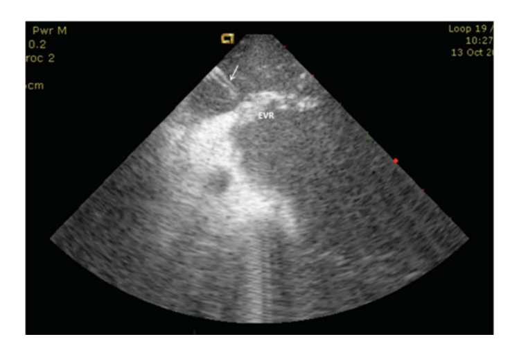
Fig. (4). ICE image of case where ablation of the muscular EVR was performed from the venous side to complete the block on the CTI. Arrow: ablation catheter, EVR: Eustachian-valve/ridge.