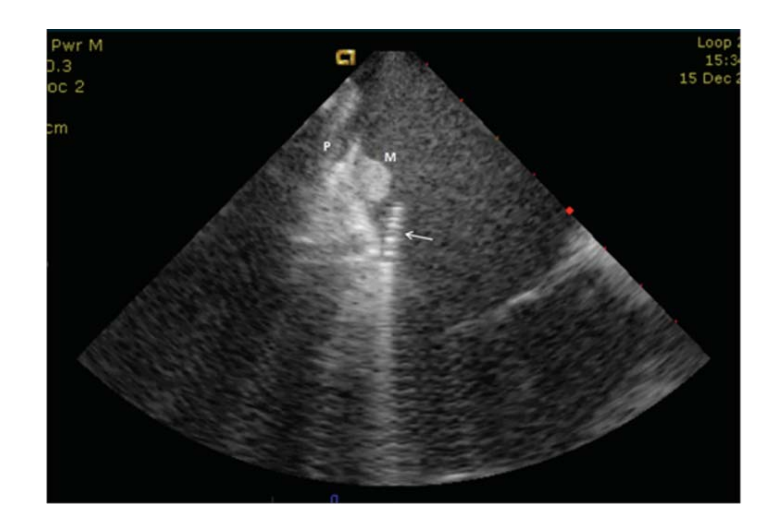
Fig. (3). CTI with a muscular bundle on the ventricular side and a deep and narrow pouch on the atrial side of the isthmus. Targeted ablation of both structures was needed to establish a block on the isthmus. Arrow: ablation catheter, P: pouch, M: muscular bundle.