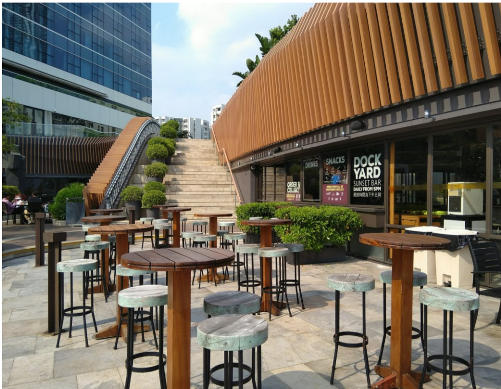
Figure 3 Privately owned public space in Hong Kong

in Hong Kong enjoys on average 2.7m 2 of open space. Although the area of open space per capita is 0.7 m 2 higher than the minimum requirement set by the government, it is significantly less than other comparable Asian cities, where the corresponding figures are 5.8m 2 in Tokyo, 6.1m 2 in Seoul, 7.4m 2 in Singapore, and 7.6m 2 in Shanghai (Lai, 2017). While the general shortage of land resources may be one of the contributing factors, the relative deficiency of public space provision is also indicative of how public space is viewed and valued by the Hong Kong government. As Tang (2017, p. 82) suggests, public space in Hong Kong ‘has a lower priority in land allocation by the government’ in comparison to other urban land uses. As I point out in the case study on Kwun Tong, public spaces are often replaced by residential buildings in urban development and redevelopment projects due to the constant pressure and demand for more housing units in Hong Kong. Furthermore, since public space developments are often conceived as a box-ticking exercise, they tend to focus on size and ease of management rather than spatial qualities and functions. In other words, public spaces in Hong Kong are seldom planned and designed to facilitate social interactions or engender inclusivity and publicness (Chan, 2020).