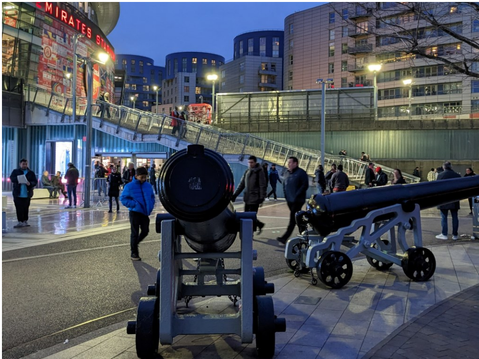
Figure 6 The cannons outside the Emirates Stadium in London, which can withstand the impact of a lorry, are part of the stadium's anti-terror infrastructure

captured and exemplified by the development and subsequent success of the High Line, which has played an important role in my conceptualisation of public space commodification.