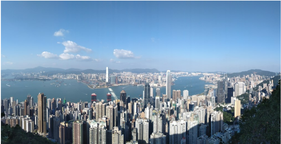
Figure 1. View of Hong Kong from Victoria Peak

This thesis is as much about public space commodification as it is about Hong Kong (Figure 1). In order to understand the transformation of public spaces taking place in Hong Kong, it is crucial to appreciate the different forces and processes that have shaped the development of this frontier city between China and the West. In this chapter, I therefore set out to present the social, economic, and political contexts in which my empirical work on public spaces in Hong Kong was conducted. Despite Hong Kong's relatively short history as a former British colony and a Special Administrative Region of China, a lot has happened since its inception as a city in the mid-19th century, and it has undergone drastic transformations that entail complexities beyond the scope of this chapter and thesis. Instead of tracing and covering every aspect of Hong Kong's development, this chapter will mostly focus on issues that are pertinent to my research on public space. I will start by providing a short overview of the historical advancement of Hong Kong and highlight certain significant events that have shaped its urban development. I will then examine how