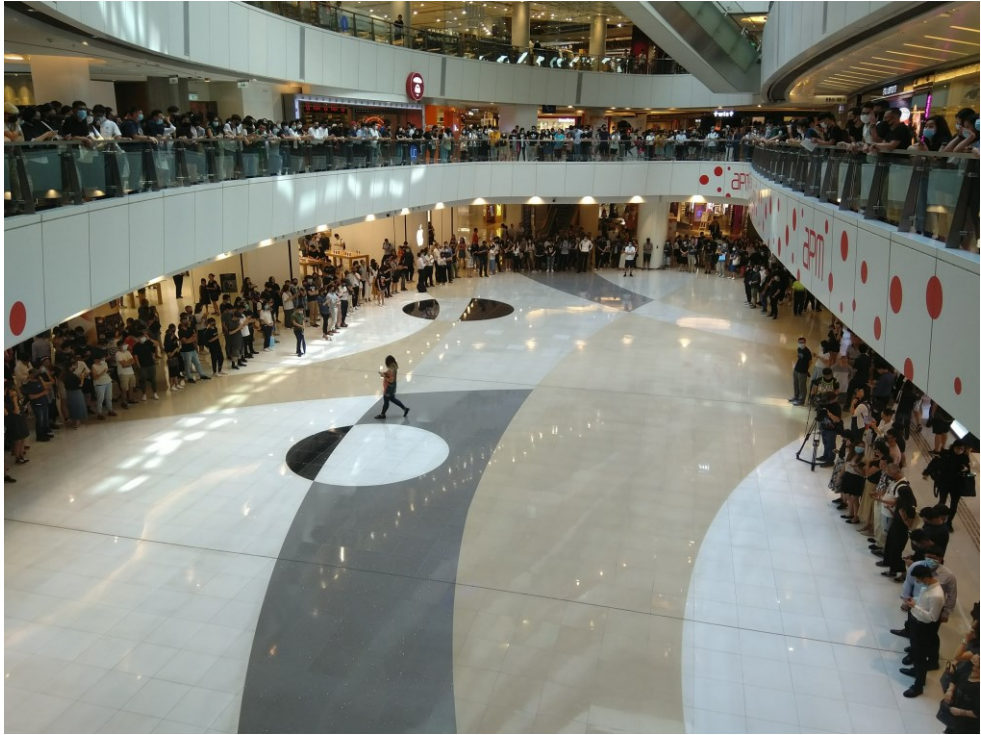
Figure 4 Hong Kongers gathering and rallying inside a shopping mall

public spaces on their days off but were then confined to their employees' homes as a result of the restrictions (Summers, 2020). Whereas other cities around the world have slowly phased out Covid restrictions, restrictions on public gatherings and mandatory facemask use in Hong Kong are still, at the time of writing, largely in place after almost three years since COVID-19 first struck Hong Kong.