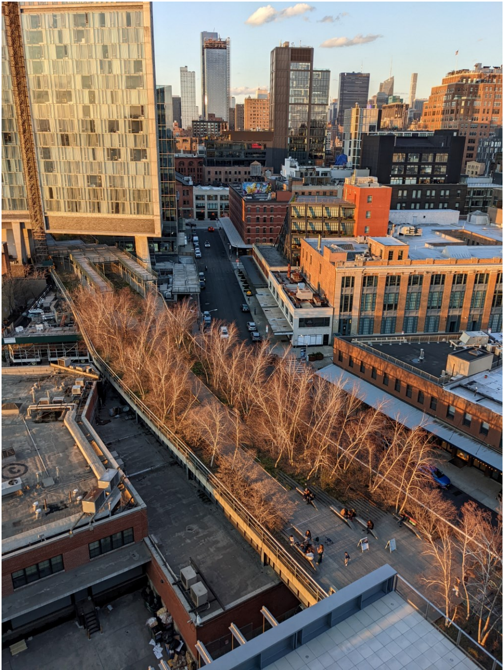
Figure 7 The High Line in New York City, United States