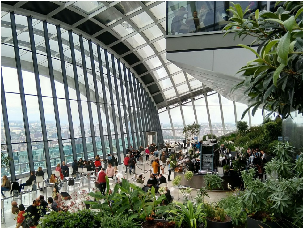
Figure 5 Sky Garden in London, United Kingdom

extract rent from supposedly public corridors and areas. Moreover, public spaces are also increasingly utilised for festivals and other temporary events centred on entertainment and consumption (Carmona, 2010; Kohn, 2004; Smith, 2014). The festivalisation of public spaces, as Smith (2014) contends, is yet another means for different stakeholders to commodify public space while temporarily limiting the general public's access to the space. Promoting consumption in public spaces is not merely the result of profit-making and commercial exploitations, it is, more importantly, also a means to pacify public spaces and control its users (Atkinson, 2003; Zukin, 1995). Commercialisation of public space has become a key strategy for governments and their private partners to exert social control over the public and to regulate their behaviours in public spaces (Harvey, 2006). As a result, public space use and access are increasingly shaped by one's ability and willingness to consume.