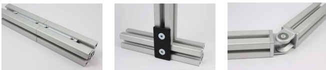
Figure 3: Aluminium groove profiles with different types of connectors (straight, 90-degree, adjustable)

needed up to which size and weight a part can be grasped and information is required whether a part is gripped positively or non-positively. A close connection between the product description and the skill description is therefore required.